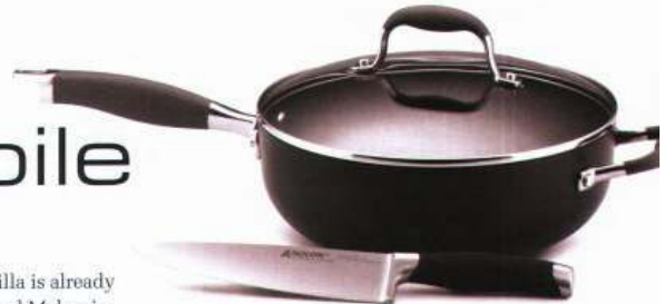
The Anolon Chef's Essentials set.